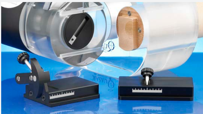
Above: Optional Rotation Stage accessory for adding 3D motion