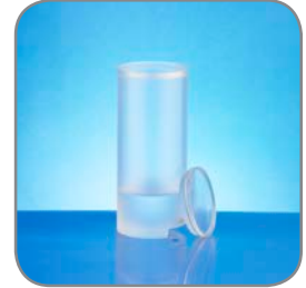
Fill with liquid or gel for user-specific tasks