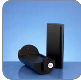
2D Dose Distribution Measurement in Neutral Density Film size: 6x15cm