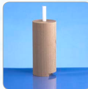
Cedar Insert (drilled) (P/N: 500-3395 - Centered) (P/N: 500-3335 - Offset)