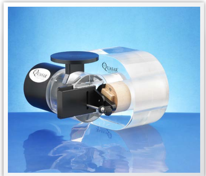
Above: The Respiratory Motion Phantom with Rotation Stage features a moving cylindrical insert in a body shaped phantom. Motion occurs in the superior - inferior direction with variable speed and amplitude, and with manual or fully programmable controls.