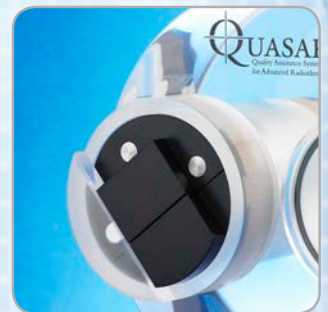
MP Insert Adapter (P/N: 500-3322)