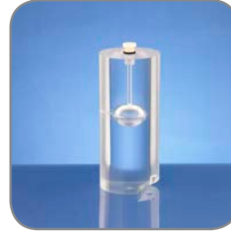
Acquisition, Reconstruction, Display and Registration 30 mm Sphere