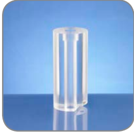
Ion Chamber Measurements in Neutral Density Material