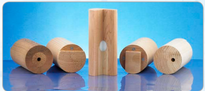
Cedar Insert with Solid Tumour-without drilling (for imaging only) (Centered P/N: 500-3311, Offset P/N: 500-3331)